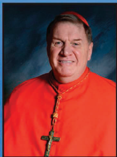
Cardinal Joseph W. Tobin, C.S.R.

We are inviting you to join our parish for a one-day pilgrimage to Washington DC.