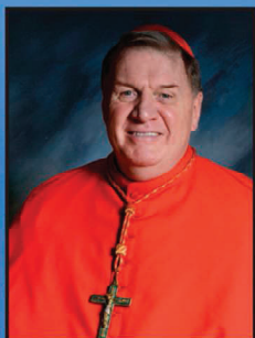
Cardinal Joseph W. Tobin, C.Ss.R.

We are inviting you to join our parish for a one-day pilgrimage to Washington DC.