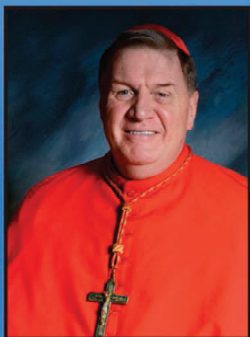
Cardinal Joseph W. Tobin, C.Ss.R.

If you are interested in going to Washington for the Jubilee Year Pilgrimage, please call the office. We need to know how many people are interested in order to arrange for a bus. Those interested, please contact the office!!!