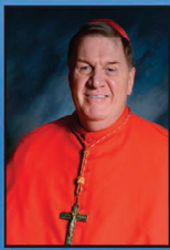
Cardinal Joseph W. Tobin, C.S.C.R.